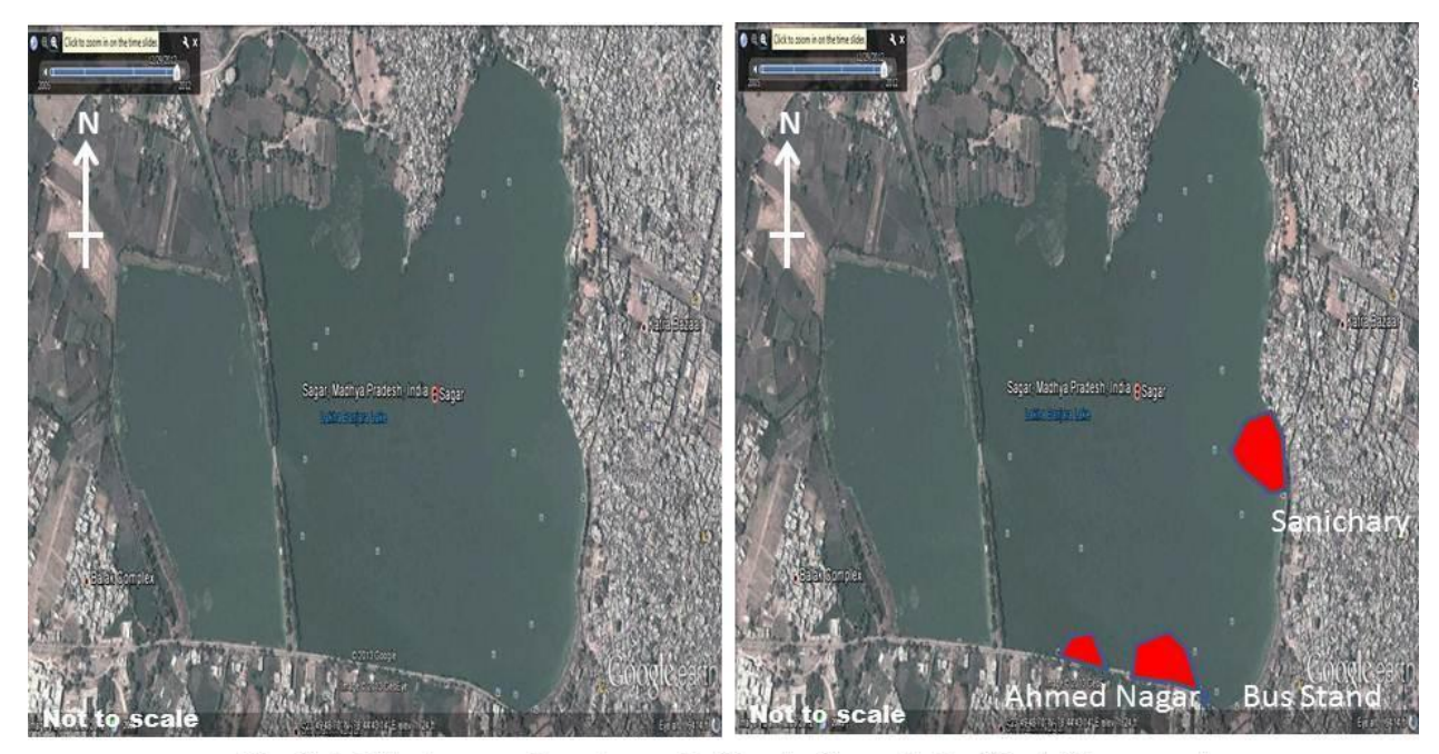
Fig. Satellite image showing pollution in Sagar Lake (Post Monsoon)