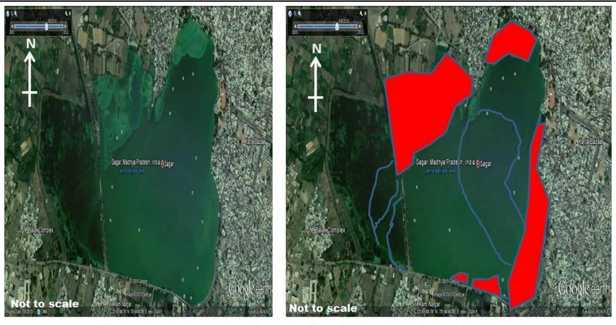
Fig. Satellite image showing pollution in Sagar Lake (Pre Monsoon)