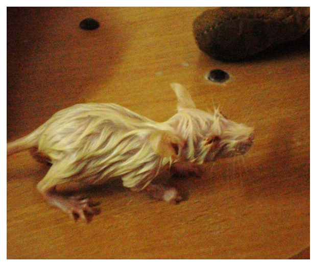
Fig.10: Young rat with greasy hair, emaciation.