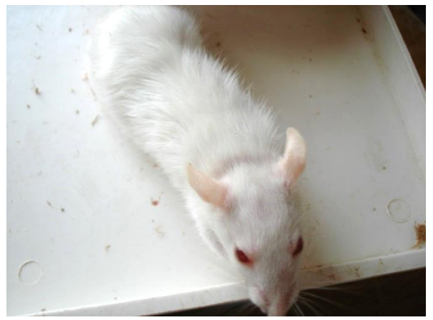
Fig.1: Control/ normal skin, healthy adult rat.

The study of toxicologic pathology of vegetable oils was done on 2 groups, untreated control which showed normal healthy rats with normal skin as in fig. 1and 2. The treated group consisted of 40 young and adult rats which showed varying severity of toxicological pathological changes characterized by emaciation, poor condition, piloerection, rough and greasy hair was shown in fig. 3 to 10. Some of the figures showed treated animals in cages will the vegetable oil container.