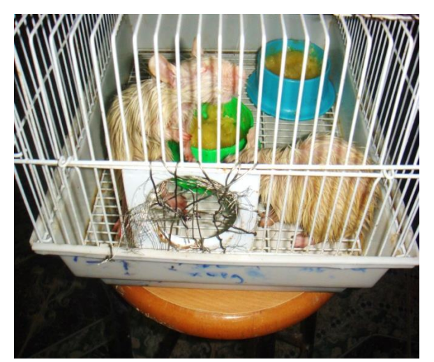
Fig.7: Treated rats note presence of dietary vegatable oil in food container, presence of the top of the cage with piloerection and greasyness of hair.