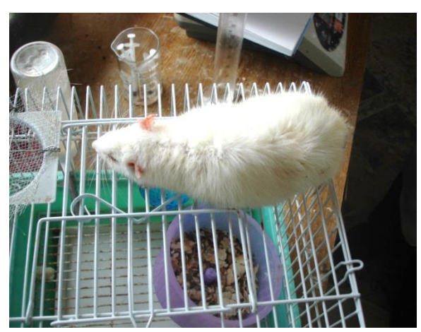
Fig.2: Control/ normal skin, healthy adult rat.