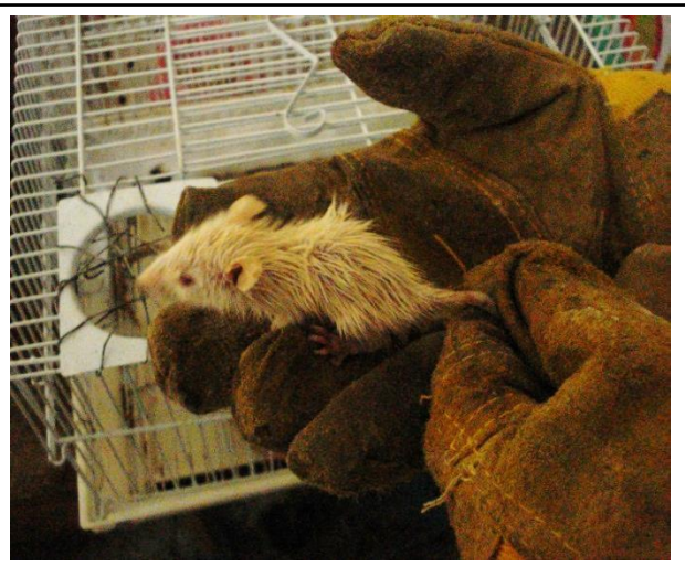
Fig.6: Treated young rat with severe emaciation and prominent piloerection and greasyness of hair.