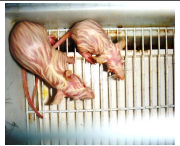
Fig.3: Tow rats treated with dietary vegatable oil note emaciation and greasy.