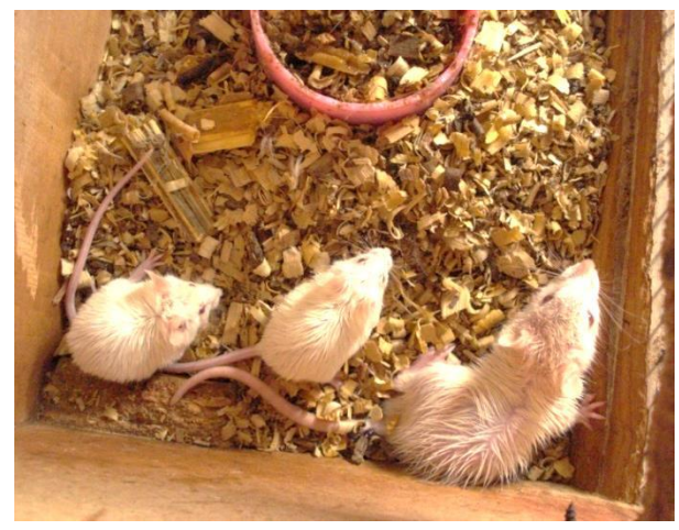
Fig.4 : Three rats, 2 untreated young rats and Adult treated showing emaciation, roughness and greasyness of hair.