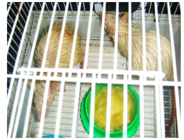
Fig.5: Tow treated rats in a cage with vegetable oil in container, note greasyness and roughness of hair.