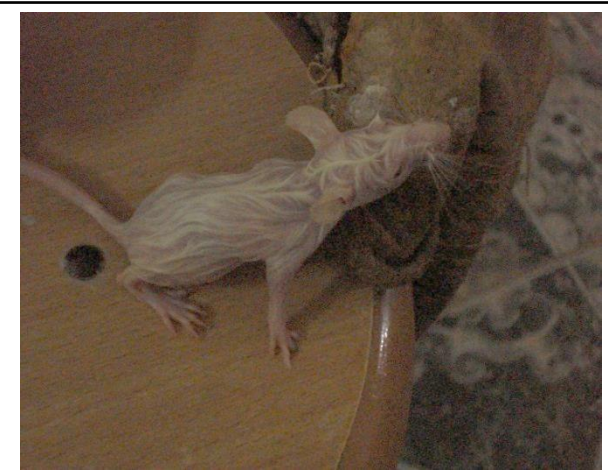
Fig.9: Young rat with emaciation and greasy hair, poor condition.