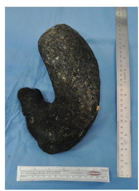
Figure IV – Gross specimen of trichobezoar removed at laparotomy.

She was treated medically to optimize anemia and thrombocytopenia. Her preoperative hemoglobin and platelet counts were 12.5 g/dL and 79,000 cells respectively. At laparotomy, a large lump occupying the entire stomach was noted. The trichobezoar measuring 25 cm x 10 cm and weighing 2160 grams was removed in toto. The biopsy taken from edge of the ulcer was reported as acute – on – chronic gastritis. There was no extension of bezoar into the duodenum. The girl had an uneventful postoperative recovery. She progressed to normal feeds by 5<sup>th</sup> post operative day. She is on follow up for management of ITP and IDA.