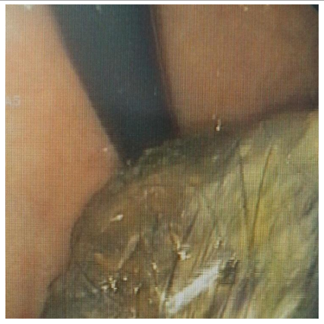
Figure II – Oesophagogastroscopy shows a large ball of hair follicles noted in the stomach suggestive of trichobezoar.