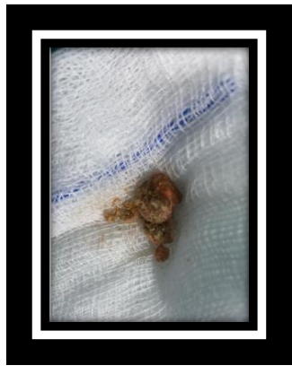
Figure 3: Common Bile Duct stone

Emergency Laparoscopic choledochotomy was performed. Choledochoscopy showed impacted dormia basket with large stone present in the lower CBD at ampulla level as shown in figure 2. Initially, laparoscopic assisted dormia disengagement basket was attempted, but failed. Finally the stone disengaged and extracted via small duodenotomy as shown in figure 3. Again Choledochoscopy was done and ascertained clearance of the bile duct both distally as well as proximally. Laparoscopic Choledochoduodenostomy interrupted 3-0 polyglactin. Abdominal drain placed in sub hepatic area.