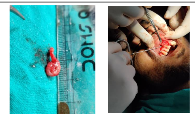
Fig. 2(a) Exised fibrocollagenous growth (b) MTA in-situ