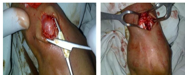
Photograph 3: Surgical Excision