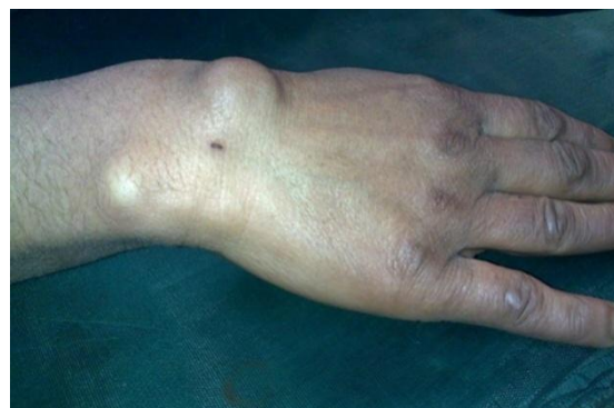
Photograph 1: Dorsal Wrist Ganglion

Symptoms: 14 cases presented with pain, 6 cases presented with tingling sensation others for cosmetic appearance and apprehension of tumor.