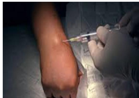
Photograph 2: Aspiration and Injection of steroid