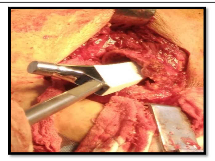
Insertion of final Femoral stem