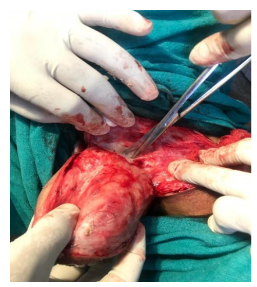
Figure 3: Epidermoid cyst during excision

kept. Fine needle aspiration cytology showed features of keratinous cyst. Excision of the cyst under local anaesthesia was done and sent for histopathology (Figure 3). Grossly, it was cystic mass of size 15*10 cm in size, globular, greyish white in colour (Figure 4). Histopathology was suggestive of epidermoid cyst with no malignant changes. Post operative course was favourable.