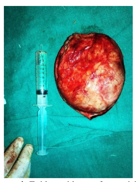
Figure 4: Epidermoid cyst after excision