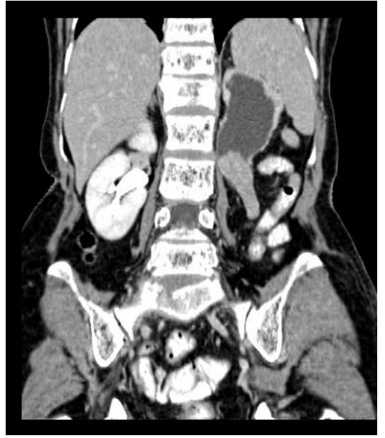
Fig.2 CT Abdomen-left Ureteric mass with hydronephrosis and vertebral metastasis