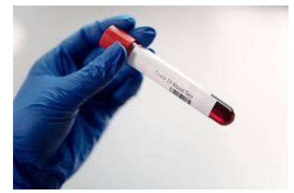
Figure: III Diagnostic Evaluation of COVID-19

Figure: II Picture Depicts the Clinical Manifestation of COVID-19