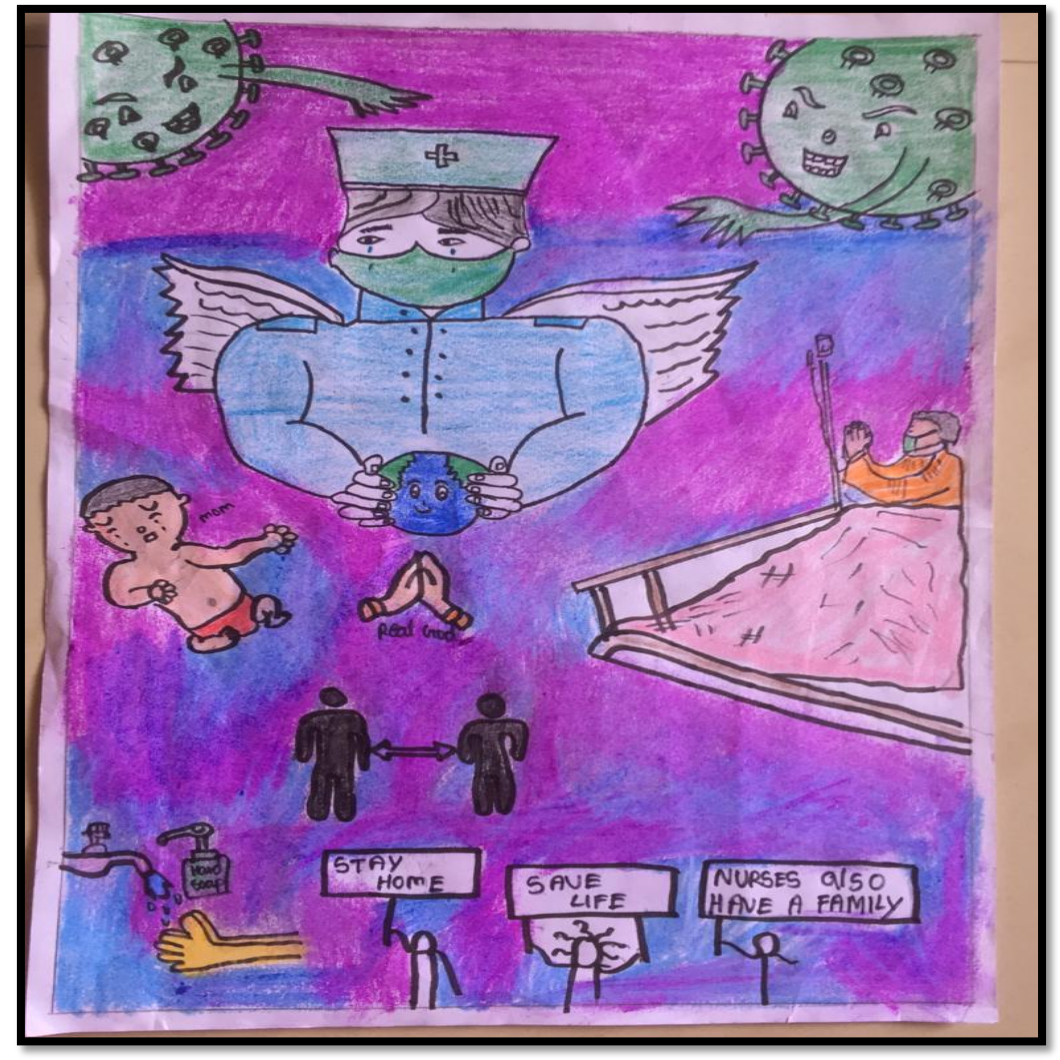
Figure: IV Picture Reveals Role of Nurse during COVID-19