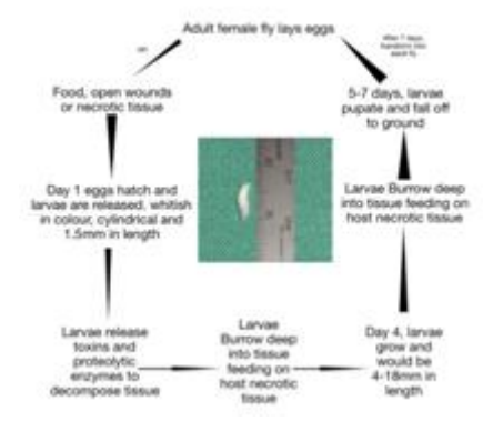
Figure 8 : Life cycle of housefly in the intermediate host

In the present case, as informed by the patient, although she felt the moments of the larvae within tissues, neglected the treatment because of which the maggots buried deep into the tissues and led to resorption of bone and ultimately periodontitis, leading to loosening and avulsion of tooth.<sup>[4]</sup>