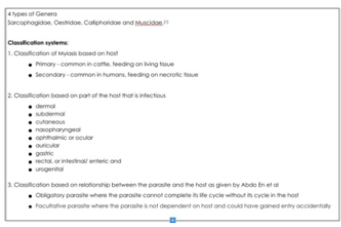
Figure 7: Classification systems for the Myiasis