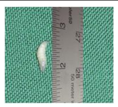
Figure 2: Whitish creamy in colour and cylindrical shape, measuring approximately around 6-8mm in length

After obtaining a written consent, Under strict aseptic conditions a cotton pellet dipped in turpentine oil was placed at the orifice of the lesion for approximately 10 min after which the larvae started coming out of the lesion. They were then grasped with the help of tweezers and removed manually and the wound debrided thoroughly and irrigated with copious saline and povidone iodine solution. The larvae were typically whitish creamy in colour and cylindrical shape, measuring approximately around 6-8mm in length [Figure 2].