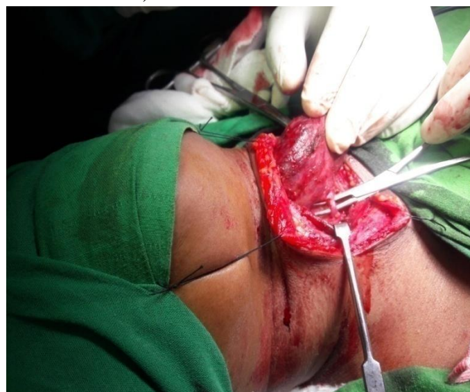
Fig. 1 Boundaries of Unified Area of Danger intraoperatively.

Data collected was analysed using appropriate tests of significance in SPSS (Statistical package for Social Sciences) R Version 3.02.