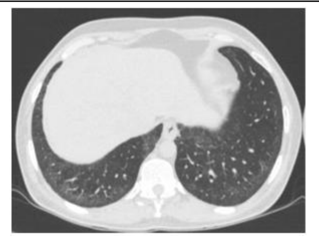
A) CT Image