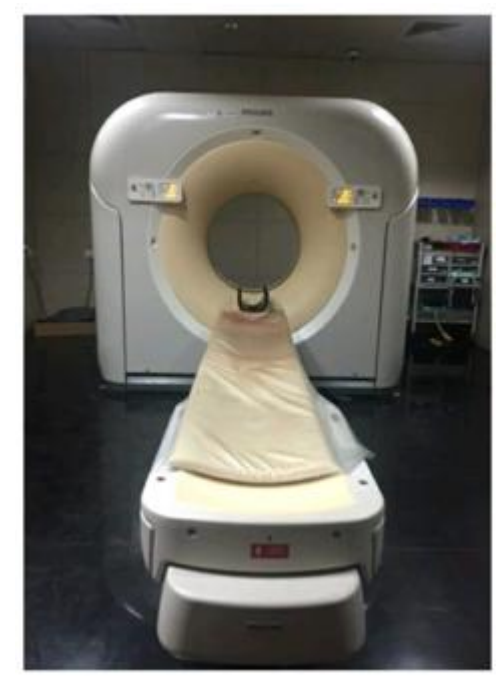
Fig 1: Philips Ingenuity 64 Detector Core 128 Slice

CT scan was performed with 64 detector row PHILIPS INGENUITY CORE 128 slice.Imaging parameters such as scan time, CTDI vol, SNR were considered to quantitatively compare HRCT and conventional CT chest in ILD. Qualitative assessments were made based on the radiologist The frequency distribution of views. the demographic data such as age, gender and other clinical data such as scan time, CTDI volume, interstitial lung disease detectable percentage and SNR are analyzed using MS EXCEL. The significance of HRCT is analyzed by implementing T-Test. The T-Test was used to evaluate the image quality scores of the findings. AP value of less than 0.05 was considered statistically significant.