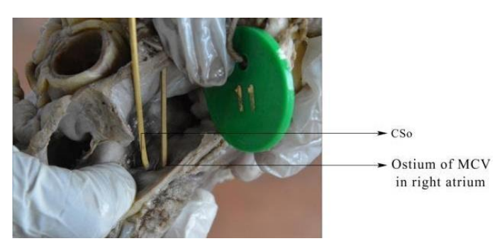
Figure 1. MCV draining directly into right atrium