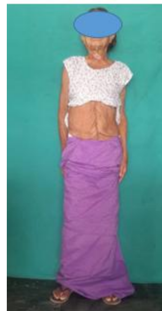
Figure.4: Post surgery 3 weeks follow up.