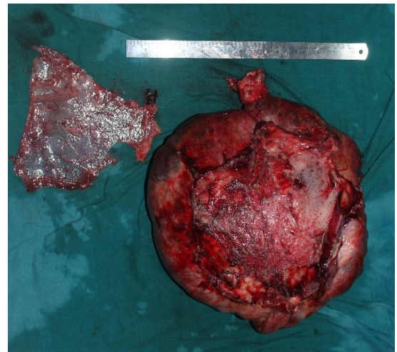
Fig. 3a & 3b: Complete en bloc resected specimen measured 30 cm x 30 cm x 15 cm and weighed 7.5 kg