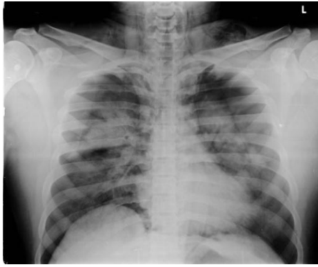
Fig 1: Chest x ray revealing subcutaneous emphysema and pneumothorax.