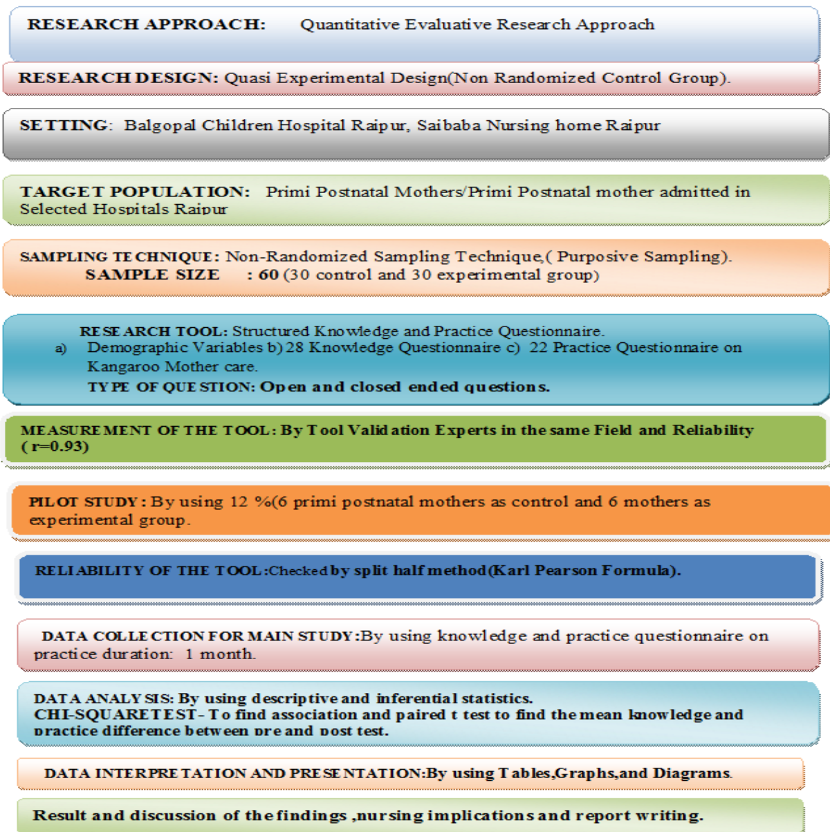
Figure No: 2 Schematic Diagram of Research Methodology