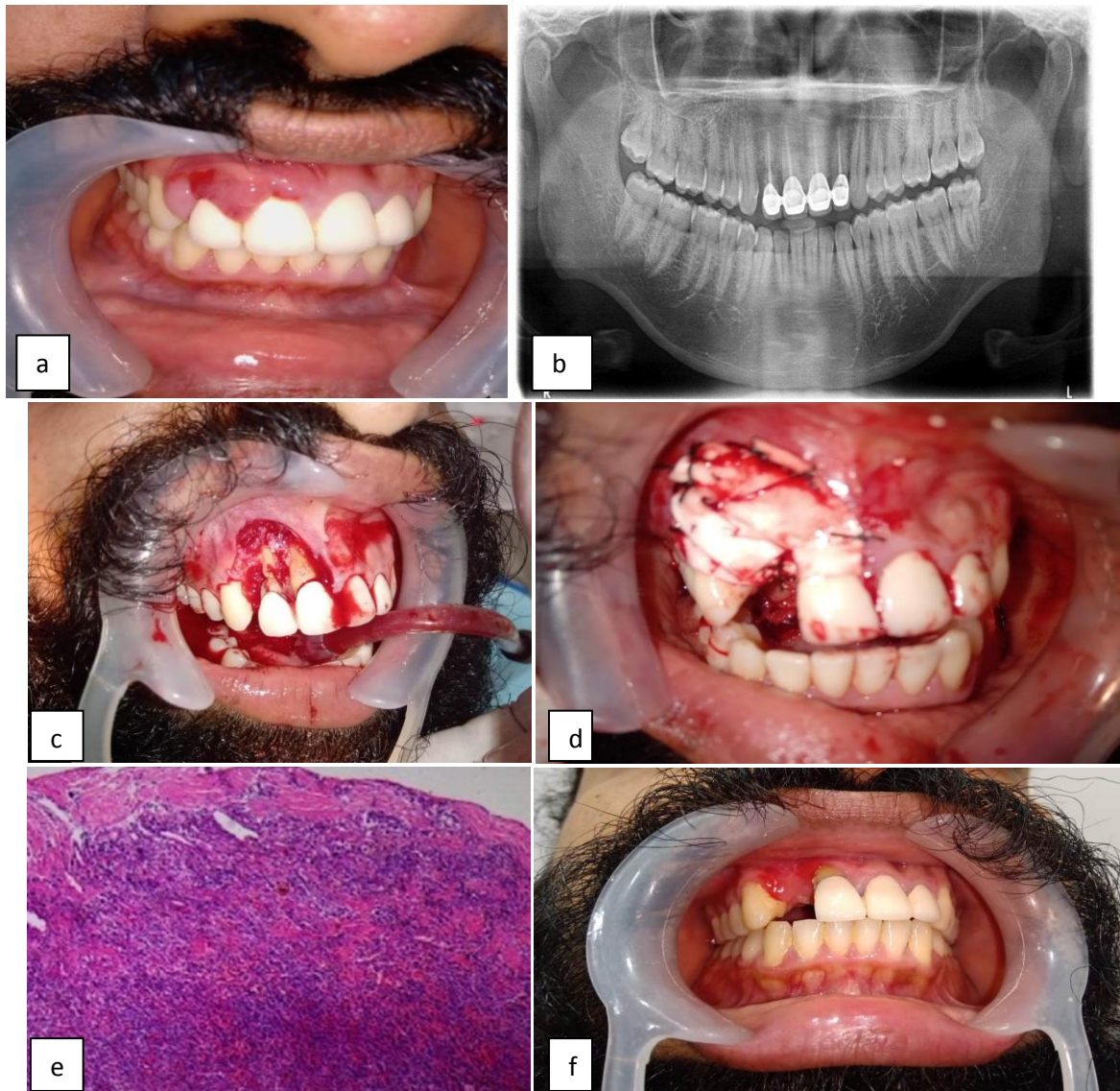
Figure 1: (a) Pre-op clinical photograph of gingival growth; (b) Orthopantomograph showing radiolucency and breach of root continuity of tooth no. 12; (c) Intra-op photograph showing mid root resorption of tooth no.12 and complete resorption of labial alveolar bone of tooth no. 11, 12. (d) Bone grafting done and secured with collagen graft on the defect; (e) Histopathological features suggestive of periapical granuloma; (f) 2 months post-op photograph showing proper healing of surgical site with mild gingival recession of tooth no. 11.