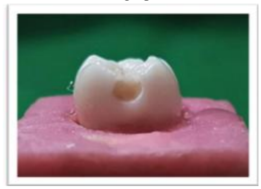
Figure 1: Clark's Class II cavity preparation (Group A)

The Tetric N-Ceram (Ivoclar Vivadent) showed the highest compressive strength than FiltekZ350 (3M/ESPE). (Table 1 & graph 1)