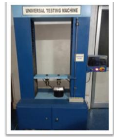
Figure 3: Universal testing machine