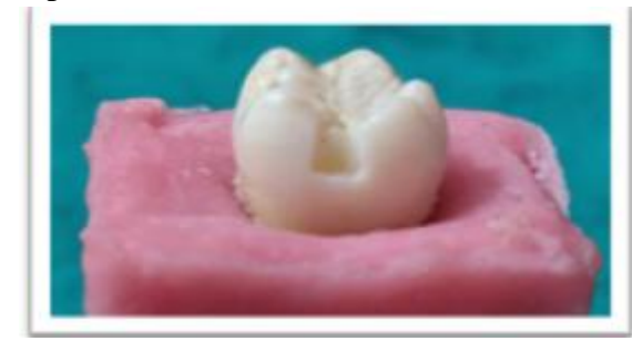
Figure 2: Class II box only preparation (Group B)

Figure 1: Clark's Class II cavity preparation (Group A)