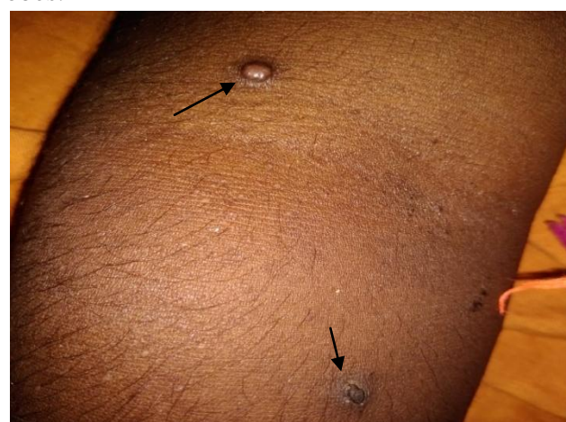
Figure 1: Arrows in this picture depicting papulonodular lesions over forearm- Cryptococcoma of skin

CSF analysis showed an elevated opening pressure of 440mm of H 2 O, no cells, hypoglycorrhychia, and elevated protein levels. CSF and serum cryptococcal antigen test [CRAG] by Lateral flow assay was positive. CSF India ink staining demonstrated encapsulated budding yeast cells (Fig 2). CSF AFB stain; gene expert MTB/Rif assay and VDRL were negative. MRI brain showed multiple hypointense lesions on T1 and hyperintense lesions on T2 and FLAIR sequences on the right temporal and left frontal lobes.