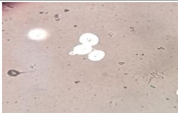
Figure 2: India ink preparations demonstrating encapsulated yeast forms.