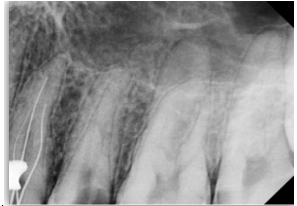
Figure 3 Establishing working length and confirmed by radiograph

The Oval shaped access preparation was made for 25. Patency was achieved for 24- using # 10 size K file for mesiobuccal and distobuccal canals, # 15 size K file for palatal canal. Patency for 25 was achieved with # 15 size K file. The working length was established with apex locator and confirmed radiographically for each root (Figure 3)