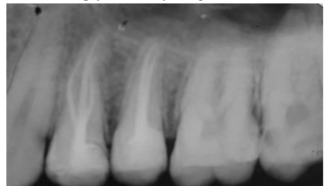
Figure 4 Post obturative radiograph

Coronal flaring was carried out with GG burs sizes- 50, 70 and 90. Cleaning and shaping was carried out using Pro Taper gold file up to F3 size. Sodium hypochlorite (5.25%), saline and EDTA (17%) were used for copious irrigation followed by placement of intra canal medication for 1 week. Calcium hydroxide was used as intracanal medication. Second appointment was scheduled after 7 days, and teeth were re-entered. The canals were cleaned and irrigated and made ready for obturation. Obturation was completed with AH 26 sealer (Densply, Germany) (Figure 4).