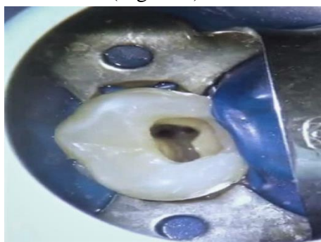
Figure 2 T-shaped outline with 2 buccal canals

Endodontic treatment for both maxillary first and second premolars was initiated. Proper anesthesia was given followed by rubber dam isolation. The access cavity preparation was initiated. Access cavity was slightly modified for 24as described by Balleri et al, by giving a cut at the bucco-proximal angle from the entrance of buccal canals to the cavosurface angle resulting in a cavity with T-shaped outline (8) (Figure 2).