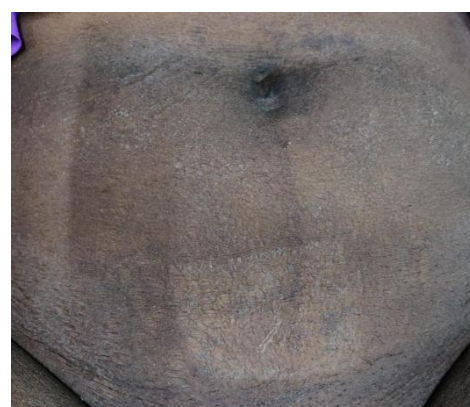
Fig 1: Represents the Grade I Dermatitis and completely healed Skin 1 month post RT