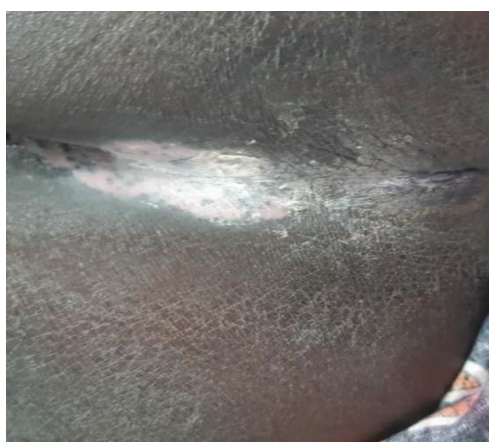
Fig 2: Represents the Grade III Dermatitis and completely healed Skin 3 month post RT.