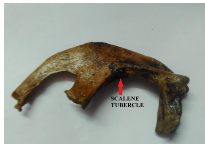
Fig – 4 showing the scalene tubercle and serratus anterior tuberosity on the outer border of second rib.

The posterior part of the inner surface of the second rib had a costal groove (fig- 5). Single rounded articular facets were seen on the heads and tubercles of the upper and lower fragments of the conjoint ribs (fig- 6).