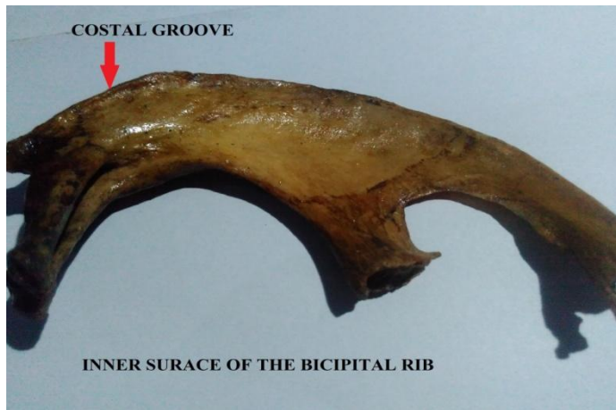
Fig – 5 shows the costal groove in the posterior end of second rib in the undersurface of the bicipital rib.