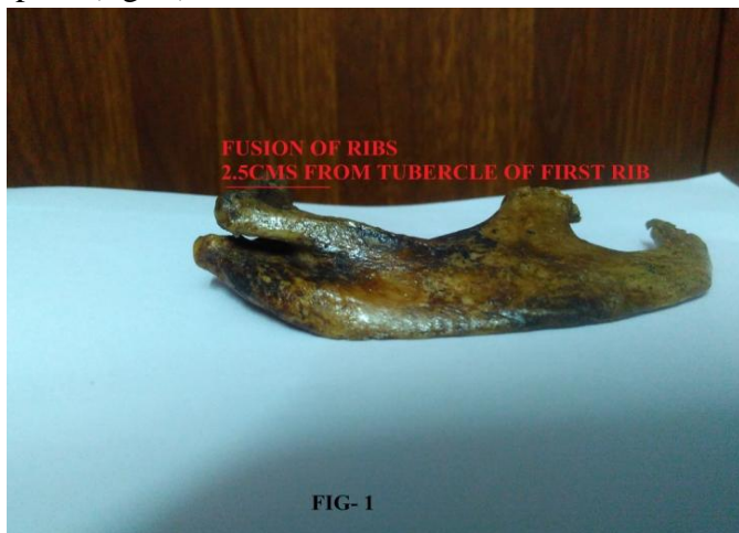
Fig – 1 showing conjoint first and second ribs with the fusion occurring 2.5cms from the tubercle of the first rib.

The morphometric analysis of the specimen revealed the fusion of the first and second ribs from a point 2.5cms beyond the tubercle of the first rib (fig-1). Fusion was found to be from above downwards, as if they were overlapping. First rib outline was visible 5.5cms from the tubercle (fig- 2). Fusion of the two ribs has took place along the outer border of the shaft of the first rib and the inner border of the shaft of the second rib, so that they had formed a large plate of bone gradually spreading in width with a maximum of 5.25cms and resulting in the obliteration of three- fourth of the first intercostals space (fig- 3).