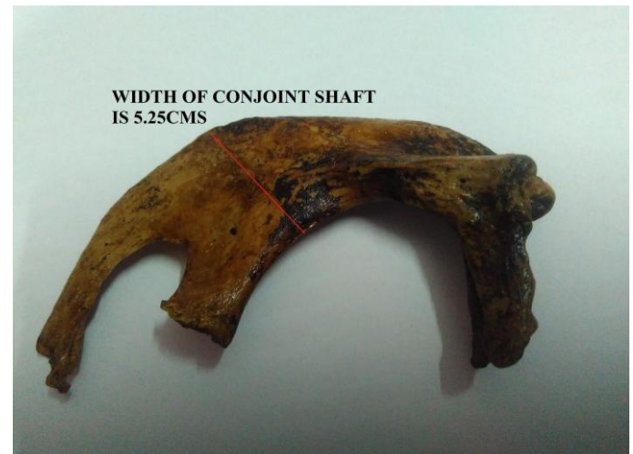
Fig – 3 showing the maximum width of conjoint shaft of about 5.25cms.

Costal ends of both the ribs were found to be separate. Impression of scalenus medius was present over the superior surface of the first rib and scalene tubercle was made out in the inner border of the first rib with serratus anterior tuberosity on the outer border of second rib. (fig- 4).