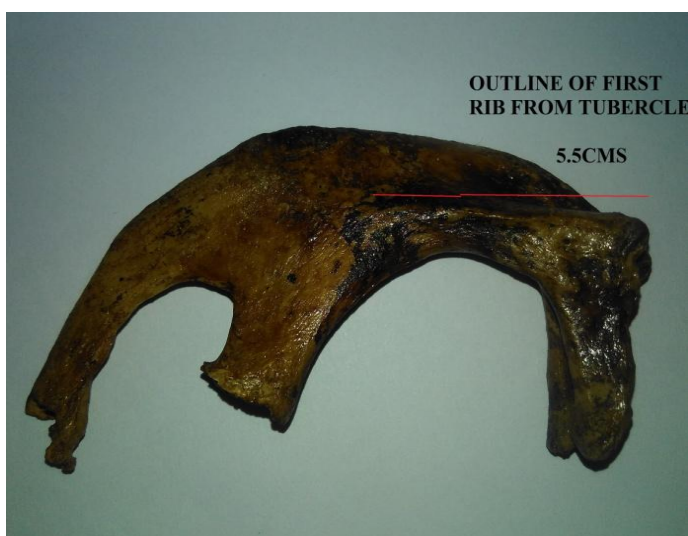
Fig – 2 showing the clear outline of the outer border of first rib of about 5.5cms from its tubercle.

Costal ends of both the ribs were found to be separate. Impression of scalenus medius was present over the superior surface of the first rib and scalene tubercle was made out in the inner border of the first rib with serratus anterior tuberosity on the outer border of second rib. (fig- 4).