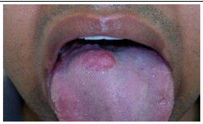
Figure 1: Clinical photograph showing nodular swelling on tongue