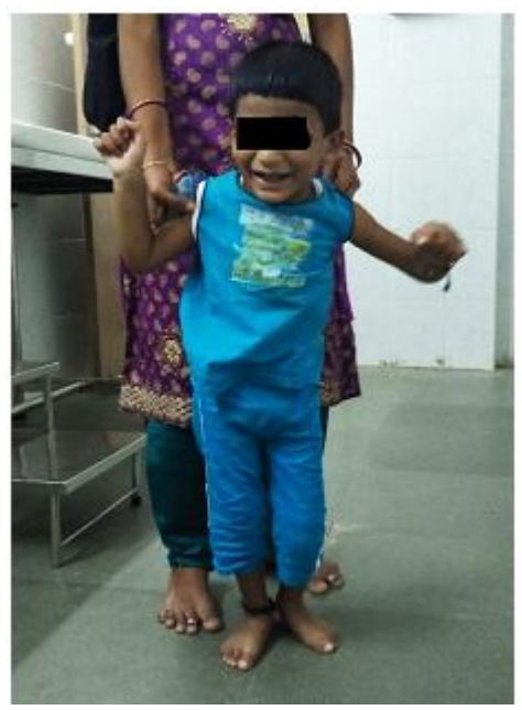
Figure 1: Clinical picture of the child

significant perinatal history or family history. The elder sibling was normal.