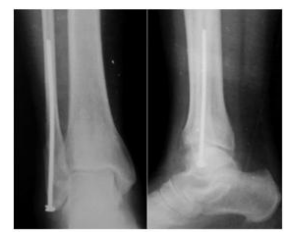
Fig 3b: postoperative x rays