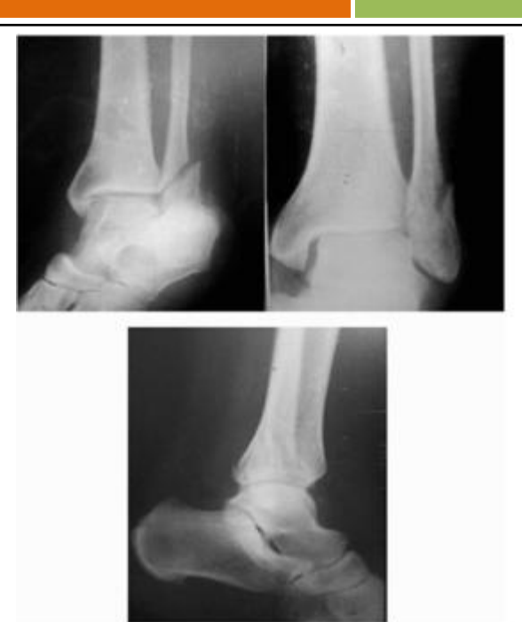
Fig 3a preoperative x rays in AP, lateral and mortise views