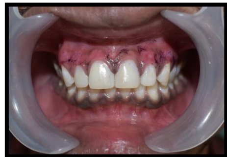
Follow up on 3 rd day shows more uptake of disclosing agent on control site