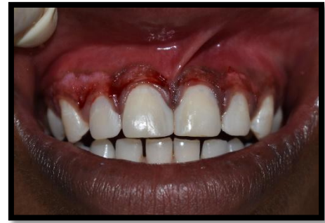
Raw Surface Left Behind After Depigmentation