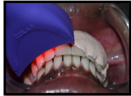
Application of LLLT on the Test Site