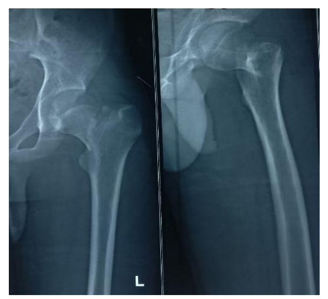
Fig 2 X-ray of a16 year old young patient showing Pauwels' type 3 fractures

Anatomic reduction and internal fixation with an emphasis on preservation of the blood supply to the femoral head is the treatment of choice for younger patients. The primary blood supply to the femoral head is the deep branch of the medial artery. femoral circumflex anastomoses It anteriorly with branches of the lateral femoral circumflex artery and branches of the obturator artery. Additional anastomoses occur with the superior and inferior gluteal arteries, and internal pudendal artery. Although there is wide variability, the average femoral neck shaft angle measures 127^{\circ} and the average femoral- neck anteversion measures 13°.