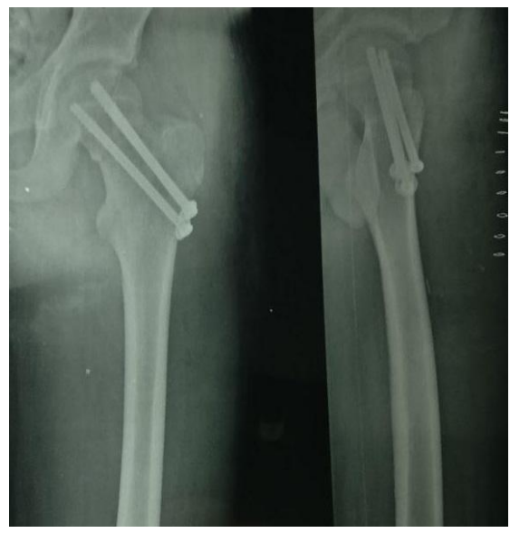
Fig 2. X-ray of a vertical femoral neck fracture treated with three cannulated screws.

With regard to the impact of implant type on nonunion rates, four out of fourteen (28) % of the fractures treated with screw fixation in our series compared with one out of eleven (9%) treated with a fixed-angle device progressed to aseptic nonunion (Figs. 2 and 3). This difference was not significant (p = 0.29), and the rates of osteonecrosis were 21% and 9% respectively for the two device categories.