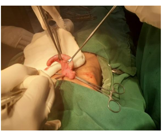
Fig 3: Appendix delivered through the mini incision

With index finger, appendix is palpated and delivered with help of Babcocks forceps. In difficult cases caecum was identified by tracing taenia and subsequently appendix was delivered (Fig 3). Appendectomy was performed as per standard procedure. Peritoneum and external oblique aponeurosis were closed with absorbable suture. Skin was closed with interrupted non-absorbable sutures. Patients were started on oral liquids on first postoperative day. Incision length, operative time, post-operative pain score, wound infection, length of hospital stay and post-operative pain were analyzed. The patients were analyzed during the follow up after 2 weeks and then after 3 months for their status and scar status.