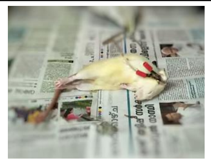
Figure 2 Wistar Albino rat during hind limb extension