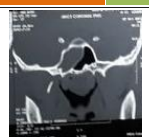
Fig 2 CT scan showing isolated sphenochoanal polyp.

Sphenchoanal polyp are rare tumor arising from the sphenoid sinus and presents at the choana .Its main presenting symptom is progressive nasal obstruction. It is imperative to differentiate Sphenochoanal polyp from antrochoanal polyp for its complete clearance and prevent other sinuses from intervention<sup>1</sup>.We present a case of sphenochoanal polyp and its clinical features and surgical management is discussed. Objective in this case was to properly delineate the origin of the polyp and differentiate it from other lesions by CT scan and MRI confirmed by nasal endoscopy, followed by meticulous endoscopic excision of the polyp. We present this case to highlight the rarity of these polyp and and careful evaluation needed before any polyp surgery.