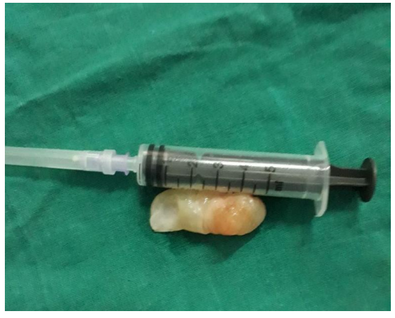
Fig1.Specimen of sphenochoanal polyp

Functional endoscopic sinus surgery of polyp under general anesthesia was planned. The polyp of about 5*3*2.5cm was excised and delivered in toto from its stalk arising in sphenoid sinus through oral cavity. The sphenoid ostium was widened and the sphenoid cavity on examination was clear. Intranasal packing was done, pack was removed after 24 hours and the patient was discharged from the hospital. During follow-up of one, two, three and six months, there was no sign of recurrence and patient had no further complaints.