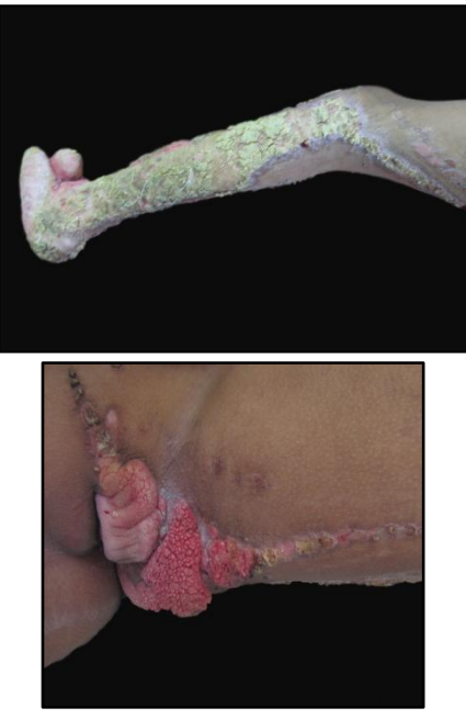
Figure1,2: Crusted, scaly, plaque, blaschoid pattern, Body fold involvement ptychotropism .

A diagnosis of CHILD syndrome was made based upon the clinical and radiological findings. Patient was prescribed topical ketoconazole, twice daily, with antibiotics for secondary infection. There was marked improvement after 3 weeks. She was discharged and advised to continue regular follow up.