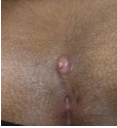
Fig 1. Sacrococcygeal pilonidal sinus with secondary abscess formation

Karidakis or Bascom methods were not used.