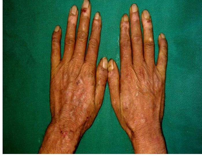
Plate 1: Acro-Facial Dermatitis