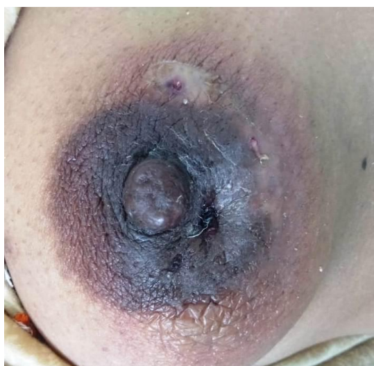
Figure 1: Discharging sinus in nipple areola area.

Laboratory workup revealed normocytic normochromic RBC picture (Ht 40%, Hb 12 g/dl), leucocytosis with lymphocytosis, Erythrocyte Sedimentation Rate =50 mm/ 1 st h. Mammography report was not available with patient. The patient was sent for FNAC with clinical differentials of carcinoma or abscess. FNAC was done under aseptic precautions using standard techniques. Smears were stained with Leishman stain. Smears showed extensive areas of necrosis and numerous neutrophilic inflammatory cells, few histiocytes and degenerated inflammatory cells (Figure 2). Smears were subjected to modified Ziehl Neelsen staining and to our surprise there were occasional acid fast bacilli (Figure 3). The diagnosis of tubercular breast abscess was made.