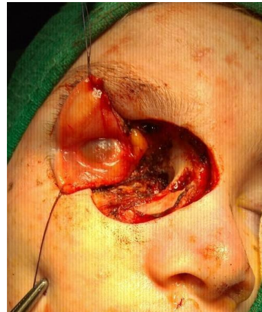
Figure 3 Case 1 Intraoperative