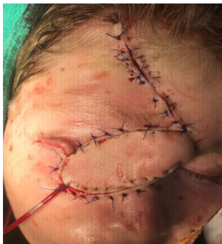
Figure 2 Case 1 Immediate post op