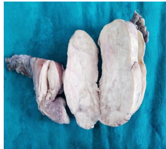
Figure 1 Cut surface of the ovarian mass showing firm, grayish white area with few yellow areas.

measuring 7.8x5.5 cm, cut section of which was grey white and had whorling. Left ovarian mass measuring 11 x 10 cm was observed. Outer surface was grey white and smooth with an intact capsule. Cut section was grey white, firm and showed whorling pattern (Figure 1). Histopathology of left ovarian mass revealed closely packed oval to spindle cells arranged in whorled and storiform pattern with few focal areas showing cells with vacuolated cytoplasm and myxoid change (Figure 2). On immunohistochemical analysis, CD 10 and inhibin showed focal positivity. The right sided adnexa and left fallopian tube were unremarkable. Uterine mass showed features of leiomyoma. A diagnosis of fibrothecoma of left ovary and leiomyoma of uterine corpus was made.