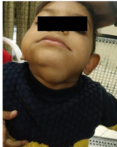
Fig1 showing swelling in left submental space

dermoid cyst. The wall of the cyst was found lined by sebaceous glands and hair follicles and keratinous debris was present filling the lumen of the cyst. The patient was kept on follow up for 3 years and there was no signs of recurrence.