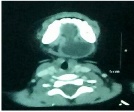
Fig 4 showing CT axial section showing hypodense lesion in left sublingual space