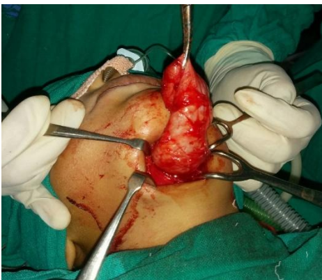
Fig 6 showing surgical excision of cyst