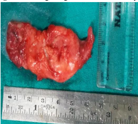
Fig 7 showing excised specimen sent for histopathological examination