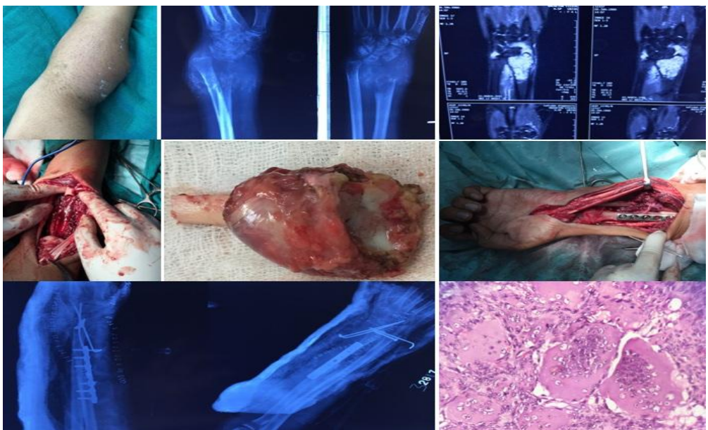
Figure 1) a) Upper row shows pre-operative clinical & radiological images of grade 3 GCT distal end radius in 21yr male. b) Middle row shows Intra-operative images of resected tumour & subsequent reconstruction with contralateral proximal fibula. c) Lower row shows post-operative x-rays & histology of the tumour. Patient had good outcome