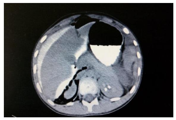
Fig 2: CECT Abdomen with oral and IV contrast