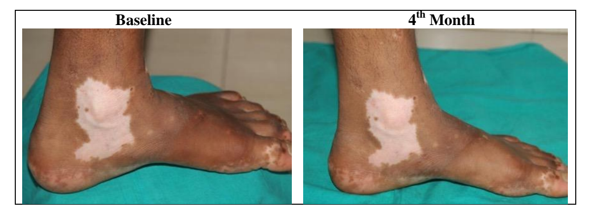
Photographs of Lesions Treated with NS + NBUVB