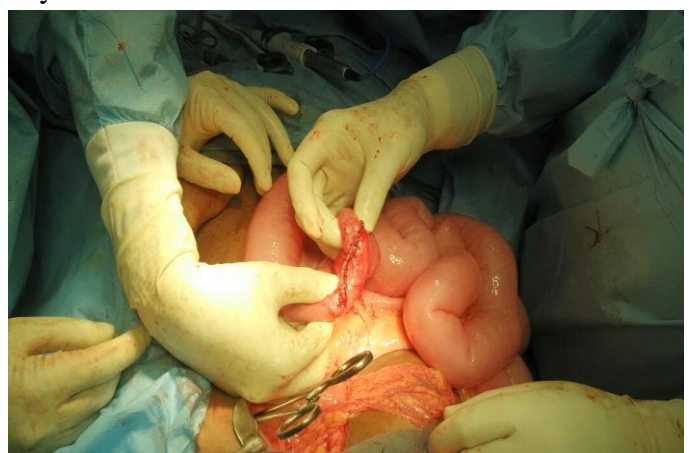
Fig 3: wedge resection of the jejunal loop and closure

Segmental resection of the stricturous and fistulous portion of colon was done and an end-to-end anastomosis was performed. Wedge resection of the jejunum with the fistulous tract was done and primarily closed. A loop ileostomy was done and the abdomen was closed. Postoperative period was uneventful. Diet was started on post-operative day 4 and the patient was discharged on post-operative day 8.