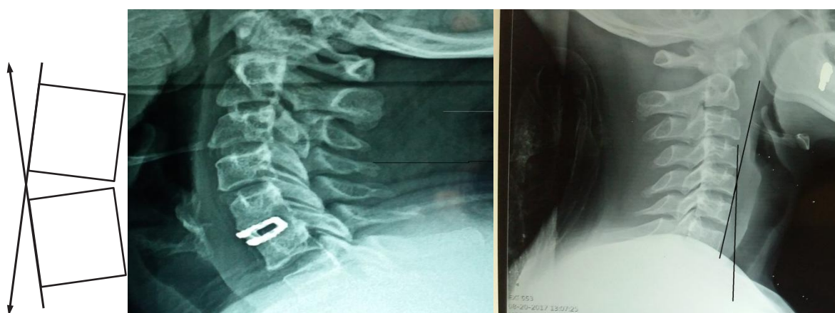
Figure 2 Anterior Cervical Diskectomy and Fusion Cage X-Ray Image with cervical normal cervical lordosis