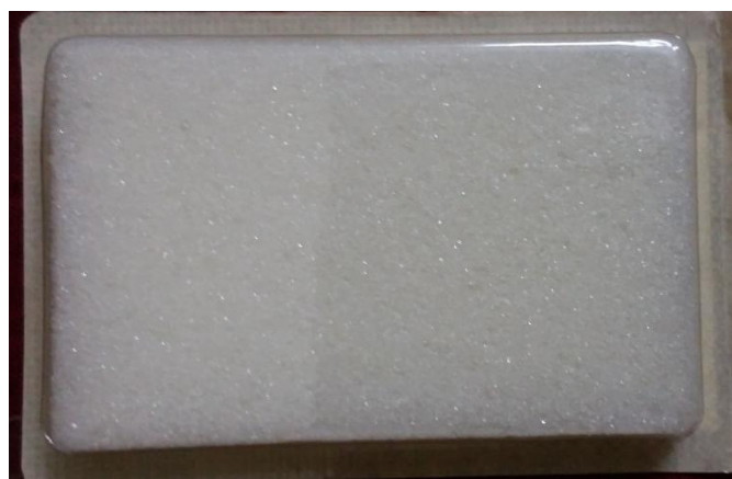
Figure 1 Gel Foam