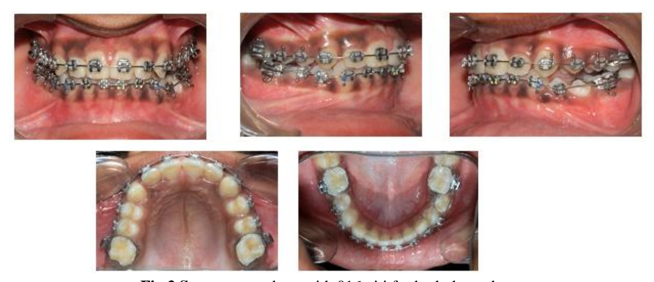
Fig.3 Strap up was done with 016 niti for both the arches