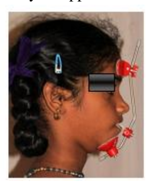
Fig.2b: Petit facemask therapy.