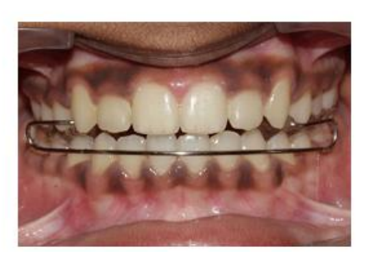
Fig.5 Retention with bionator