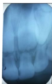
Fig. 2 Intraoral periapical radiograph of 51, 61, 62 showing root resorption of 51, 61

Fig. 1 Preoperative photograph showing the lesion. Radiological investigation included an intraoral periapical radiograph of the lesion which showed evidence of root resorption of primary teeth (51&61). Routine hematological evaluation ascertained values within normal limits. Based on the clinical findings and presentation, the differential diagnosis established were fibroma, osteofibrous dysplasia and fibrous dysplasia.