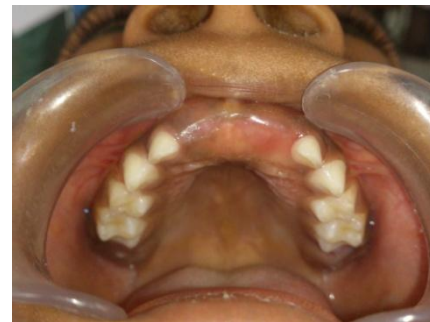
Fig. 4 Postoperative photograph after 6 months Investigation

patient after nine months showed no sign of recurrence or relapse. The patient is under regular clinical and radiological follow-ups due to the recurrent nature of the lesion.