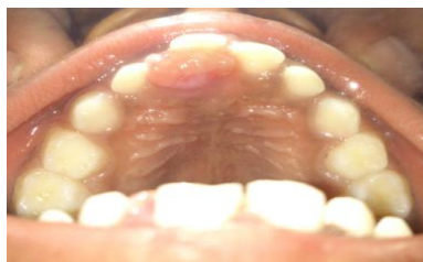
Fig. 1 Preoperative photograph showing the lesion. Radiological investigation included an intraoral periapical radiograph of the lesion which showed evidence of root resorption of primary teeth (51&61). Routine hematological evaluation ascertained values within normal limits. Based on the clinical findings and presentation, the differential diagnosis established were fibroma, osteofibrous dysplasia and fibrous dysplasia.

revealed an asymptomatic ovoid swelling measuring approximately 1.5 cm x 1 cm extending mesiodistally from mesial half of upper right primary central incisor to the mesial half of upper left primary lateral incisor; superiorly extending upto the marginal gingiva and inferiorly to the level of palatal mucosa with labially displaced upper left primary central incisor. Secondary changes such as redness and mild ulceration were seen over the swelling. There was no evidence of abscess, draining fistulae or sinuses associated with the swelling. On palpation, the swelling was uniformly firm in consistency, non tender and non fluctuant. Hard tissue examination showed Grade I mobility in deciduous right and left central incisors. (51 & 61)