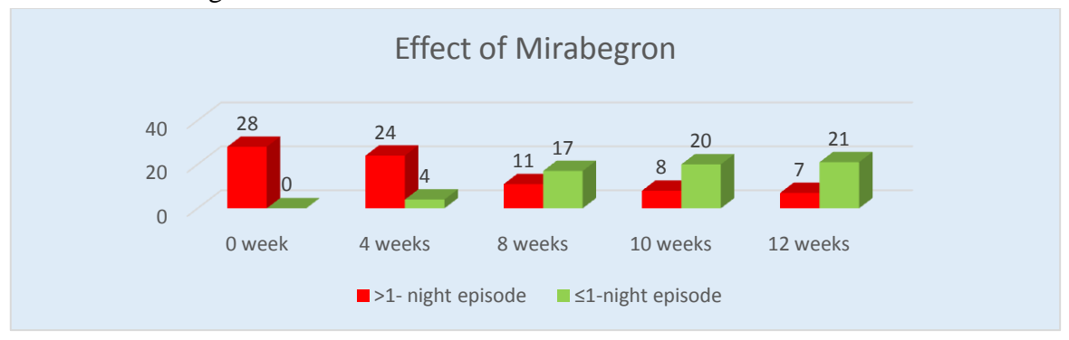
Figure-3 Effect of Mirabegron on Nocturia at various time intervals

Lastly, the effect of mirabegron on the occurrence of urge incontinence was evaluated. It was observed that amongst a total of 60 cases included in this study, 13 (21.67%) of the patients