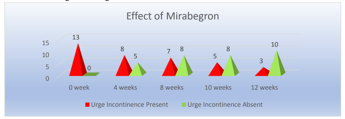
Figure-4 Effect of Mirabegron on urge incontinence at various time intervals