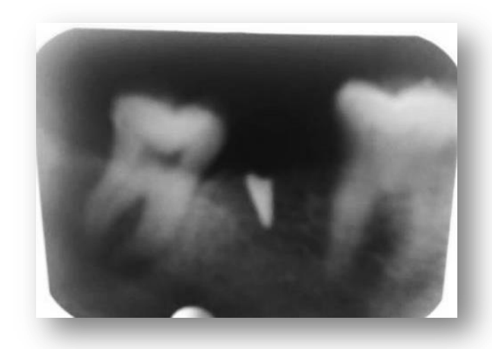
Figure 6: Illustrating IOPA Radio opaque foreign body