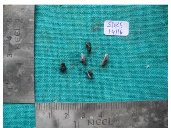
Figure 3 Illustrating Retrived foreign body (grit paricles) with granulation tissue