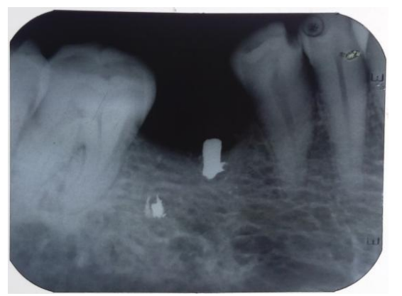
Figure 2 Illustrating IOPA Radio opaque foreign body