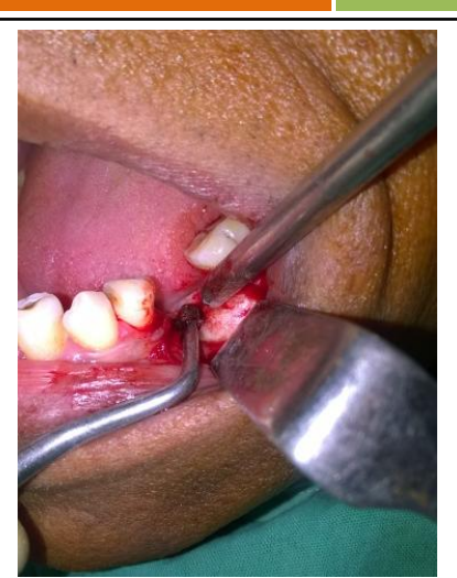
Figure 4 Illustrating retrival of foreign body from the socket