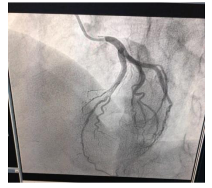
Fig. 2 Normal coronaries in CAG A diagnosis of non-ischemic DCM with heart failure was confirmed.

A male patient of 60 years presented to ER with history of progressive breathlessness and bilateral pedal edema since 15-20 days. No history of chest pain, palpitations or syncope was present. Past history of breathlessness given 3 months back for which patient was advised tablet Deriphyllin 150 mg. No history of DM, HTN, COPD, TB or thyroid disorder was present. Patient was reformed alcoholic since 30 years. On examination pulse was 100/min, BP- 96/64 mmhg, RR- 32/min, SpO2- 95% at room air. JVP was significantly elevated. Apex beat palpated more towards left and downward position. S1S2 heard. No murmurs on auscultation. Air entry reduced bilaterally, bilateral crepts present.ECG revealed left bundle branch block (LBBB). Chest X-ray showed pulmonary edema. Hb was 13.7 g/dl, Na<sup>+</sup> 139 mmol/l, K<sup>+</sup> 3.9 mEq/L, Ca 9.1 mg/dl. T3,T4,TSH levels were 1.00ng/ml, 7.2mcg/dl and 4.25 mIU/ml respectively which were normal. ProBNP was 35000 pg/ml. Troponin was 6 ng/ml. 2D ECHO screening revealed LVEF of 20-25% with DCM. No RWMA or valvular abnormalities were detected. Patient was given 60mg furosemide in ER and NIV was started. Cardiology consultation done and Coronary angiography was done which revealed normal coronaries.