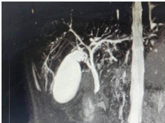
Fig 2: MRCP showing multiple focal areas of dilatation of extrahepatic bile duct.