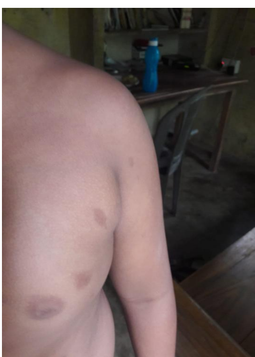
Figure 1 and 2: Urticaria pigmentosa showing multiple well-defined hyperpigmented plaques on the trunk